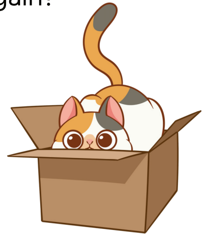
unsoiled paper & cardboard *without kitties