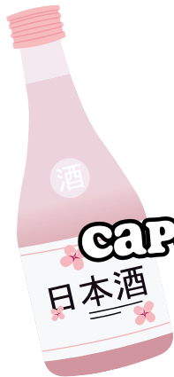
glass bottles & containers

Is your empty plastic & paper products clean enough to be used again?