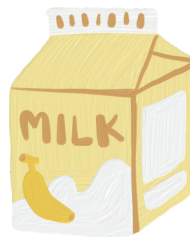
food & beverage cartons